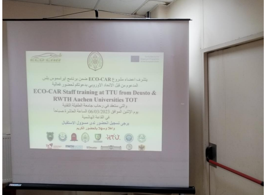
ERASMUS+ PROGRAMME Project Number: 618509-EPP-1-2020-1-JO-EPPKA2-CBHE-JP

DISCLAIMER: This project has been funded with support from the European Commission. This publication [communication] reflects the views only of the author, and the Commission cannot be held responsible for any use which may be made of the information contained therein. Page 6