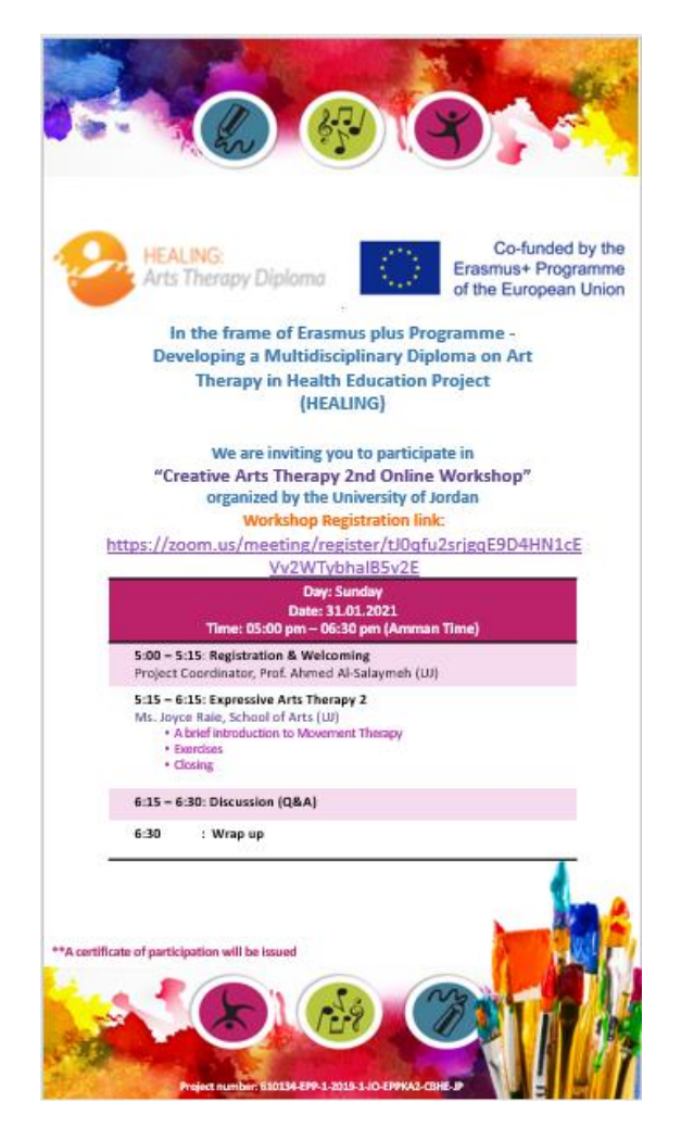
Figure 1: HEALING Event Invitation and Agenda

Below is the invitation card and the agenda that have been sent to participants.