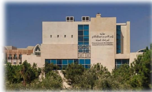
COSMO-KOM 1 st day