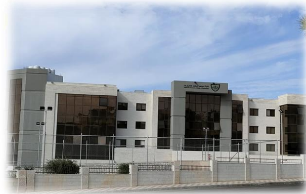
COSMO-KOM 2 nd day