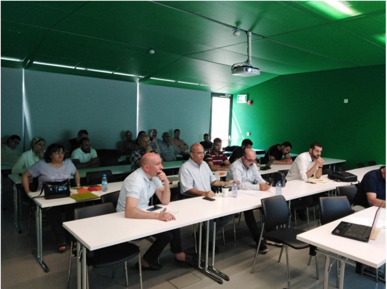
Figure 1: First day welcoming speech at the new Library building of the University of Cyprus.

On Monday, 08 th of July, 2019, the Train-of-Trainers Workshop started at University of Cyprus at 9.00 am.