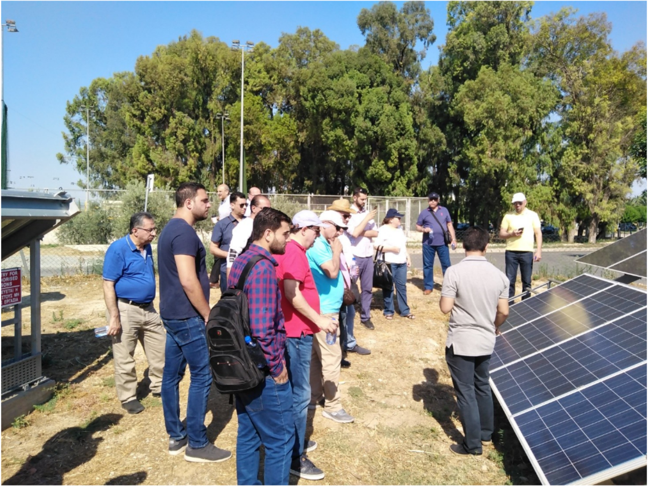
Figure 5: Participants detecting faults on 11 y.o. solar panels at the PV laboratory