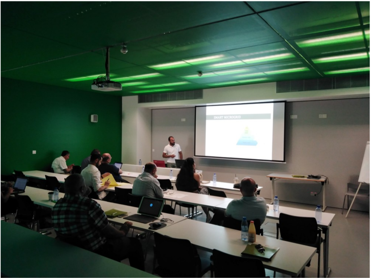
Figure 3: "DC and hybrid AC-DC systems" by Chrysanthos Charalambous

ERASMUS PLUS Programme-HEBA Project Number: 585740-EPP-1-2017-1-AT-EPPKA2-CBHE-JP