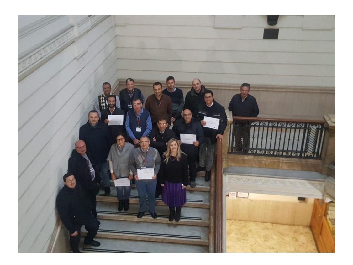
Fig. 4 and 5 - TOT Participants group pictures