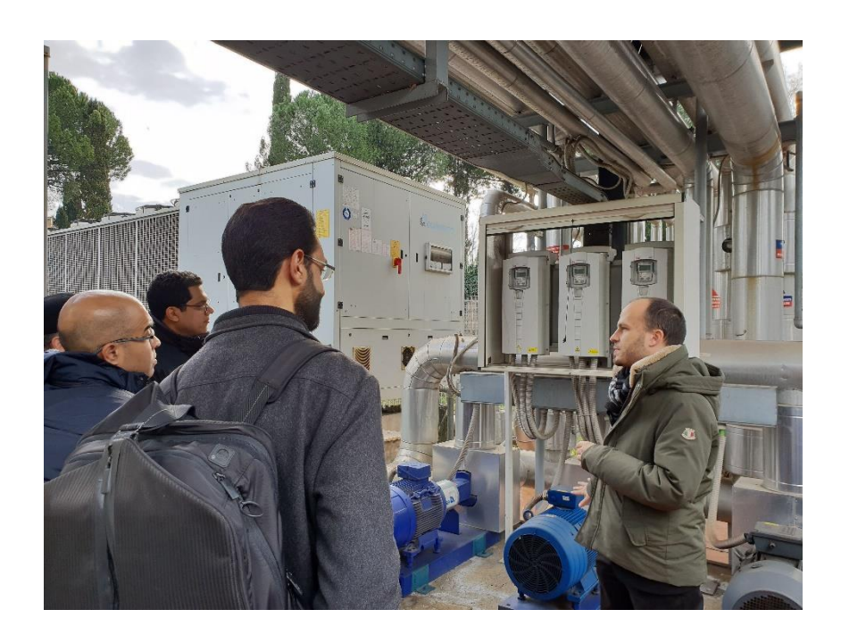
Fig. 3 Technical visit at CONI - Comitato Olimpico Nazionale Italiano - Meeting with the Energy Manager