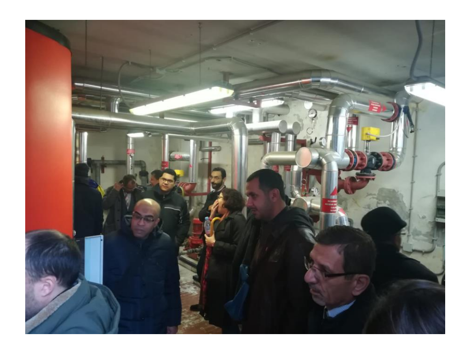
Fig. 2 Technical visit at CONI – Comitato Olimpico Nazionale Italiano